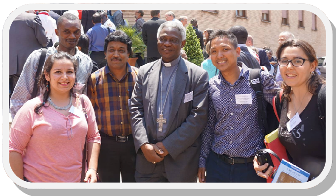
From Left: MIJARC ; IMCS-MIEC; Cardinal Turkson; JOCI-YCWI; YCW-JOC

We had the opportunity to meet the partners of CIDSE to exchange some ideas about the new guidelines, also the youth movements present there we used this occasion to strength our links and to rethink our strategy for visibility.